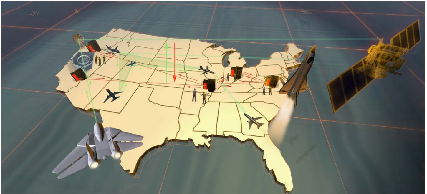
Figure 3. Dynamic, re-configurable Airspace-wide Simulation Environment in the Distributed High Fidelity National Modeling Stage

Simulation will be selectable across the range Airport, Region, Country, Hemisphere, and, Planet. Dynamic National Airspace-wide simulations will allow “virtual airspace design.” The VNAS will automatically assess and choose the best network and hardware topology to meet demands of the moment. Rapid turnaround and re-assembly capabilities will enable trade studies and “what-if” scenario evaluation as well as high-fidelity National Airspace-wide analyses. Furthermore, to achieve a goal of gradual improvement in the quality of models and simulations the VNAS’s development will involve extensive collaboration with researchers who are developing models and simulations, that are related to the National Airspace.